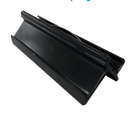
EL-100 & EL-200 Spring Latches