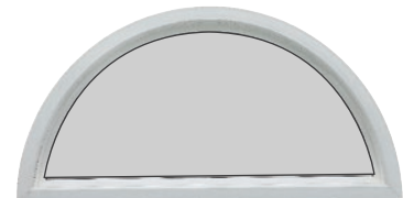
Architectural Half Circle