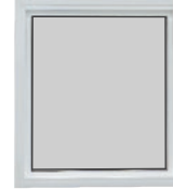
Casement Picture Window