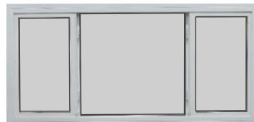
Horizontal Roller XOX