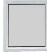
Casement Picture Window