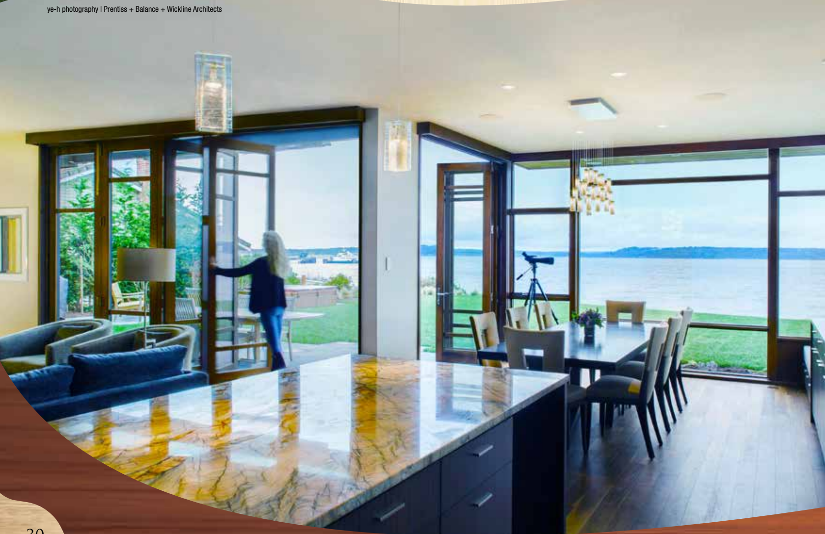
Prentiss + Balance + Wickline Architects