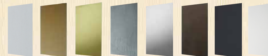
Satin Nickel PVD Antique Brass Bright Brass Brushed Chrome Polished Chrome Oil-Rubbed Bronze FB+ Matte Black White