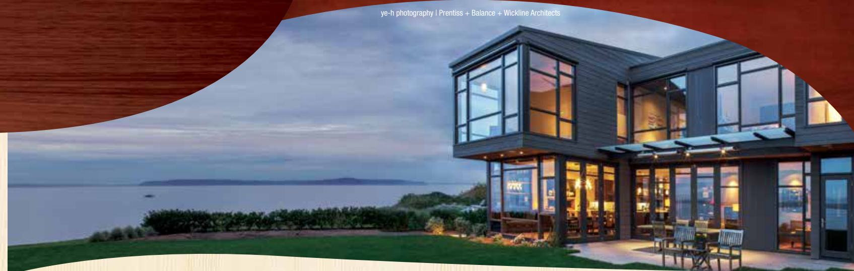
Prentiss + Balance + Wickline Architects

FeelSafe laminated insulated glass constructed on the outside for maximum protection.